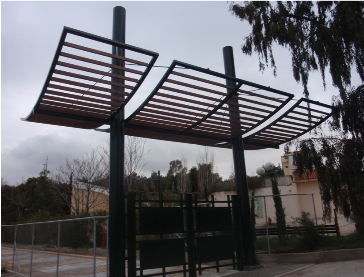
Main Entrance structure