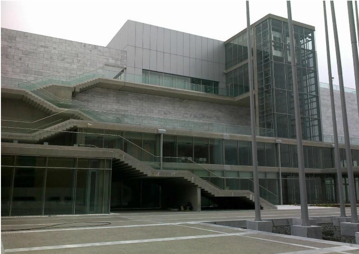
Building View from surrounding area