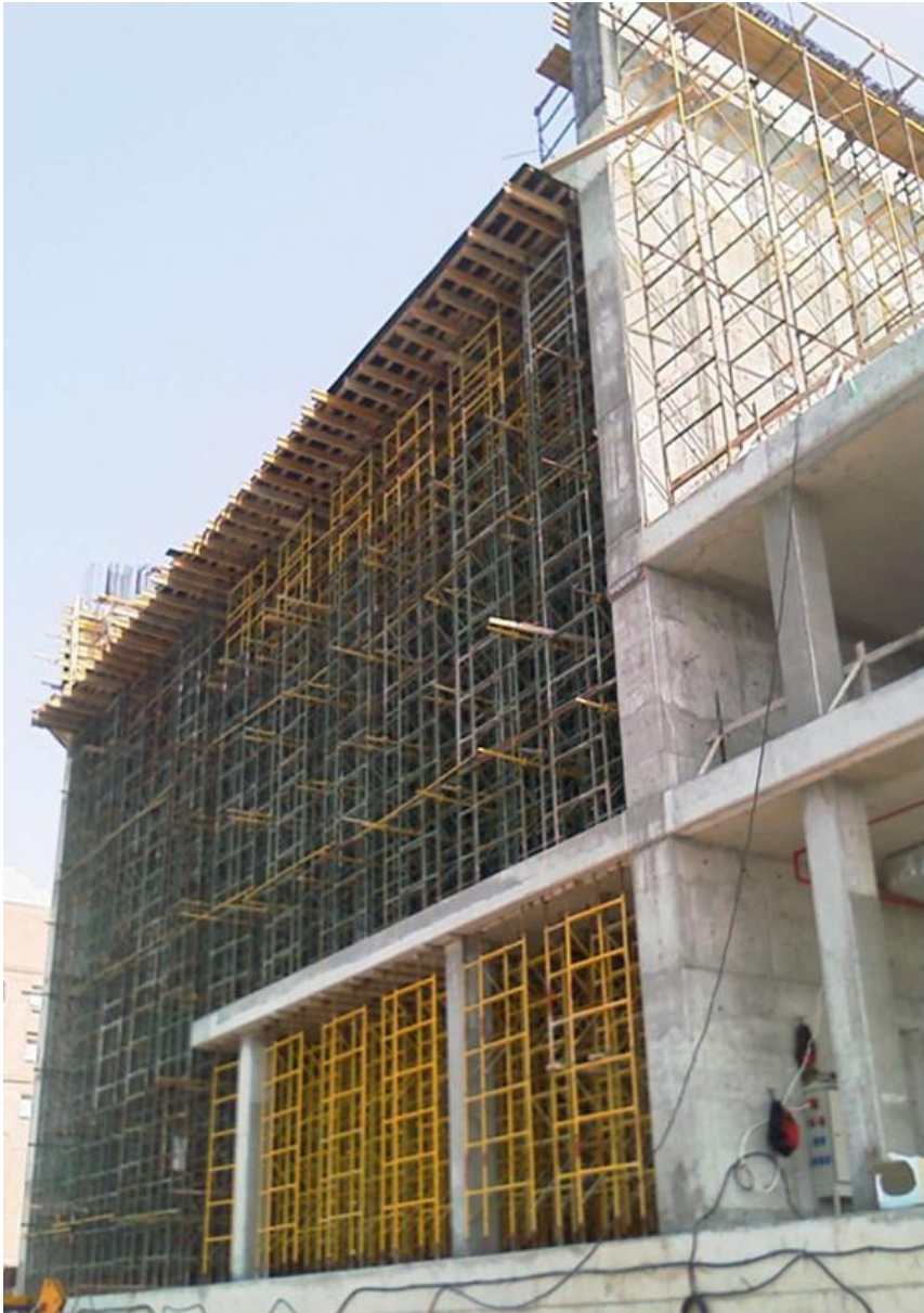
Framework support during casting