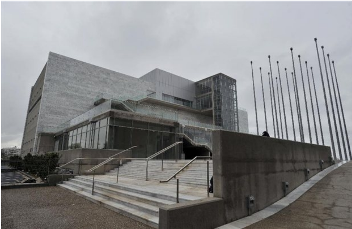
Building View from surrounding area