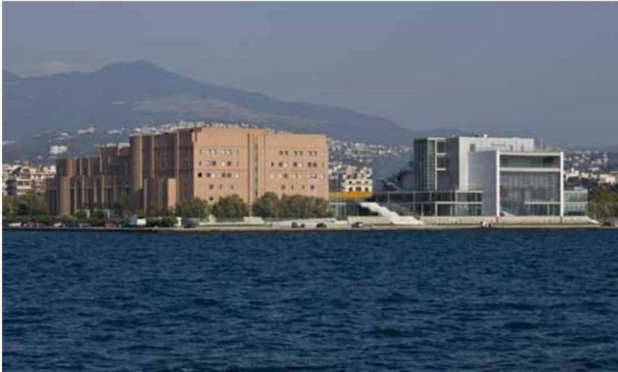
Genetal View of both MMTH buildings