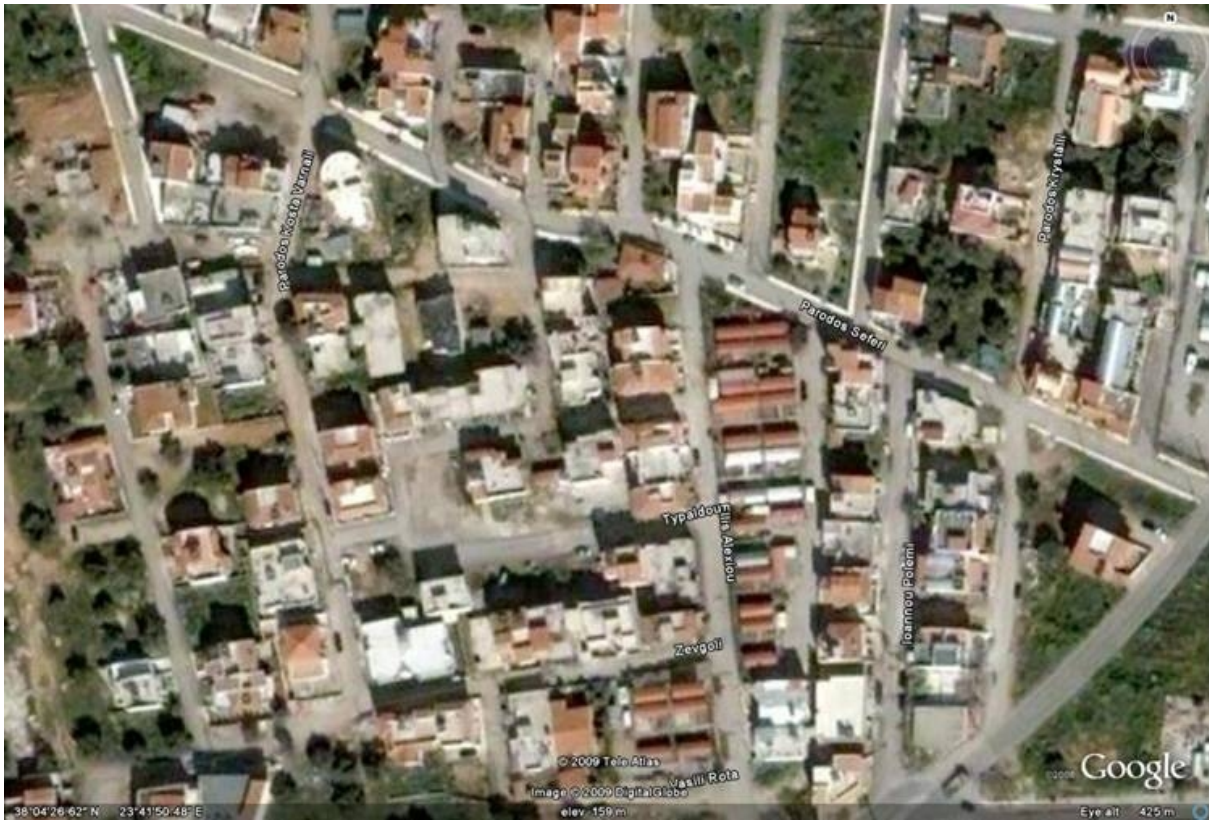
Aerial View of BB 1374 after reconstruction