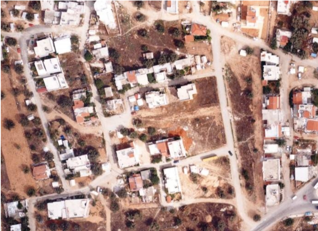
Aerial View of BB 1374 before earthquake