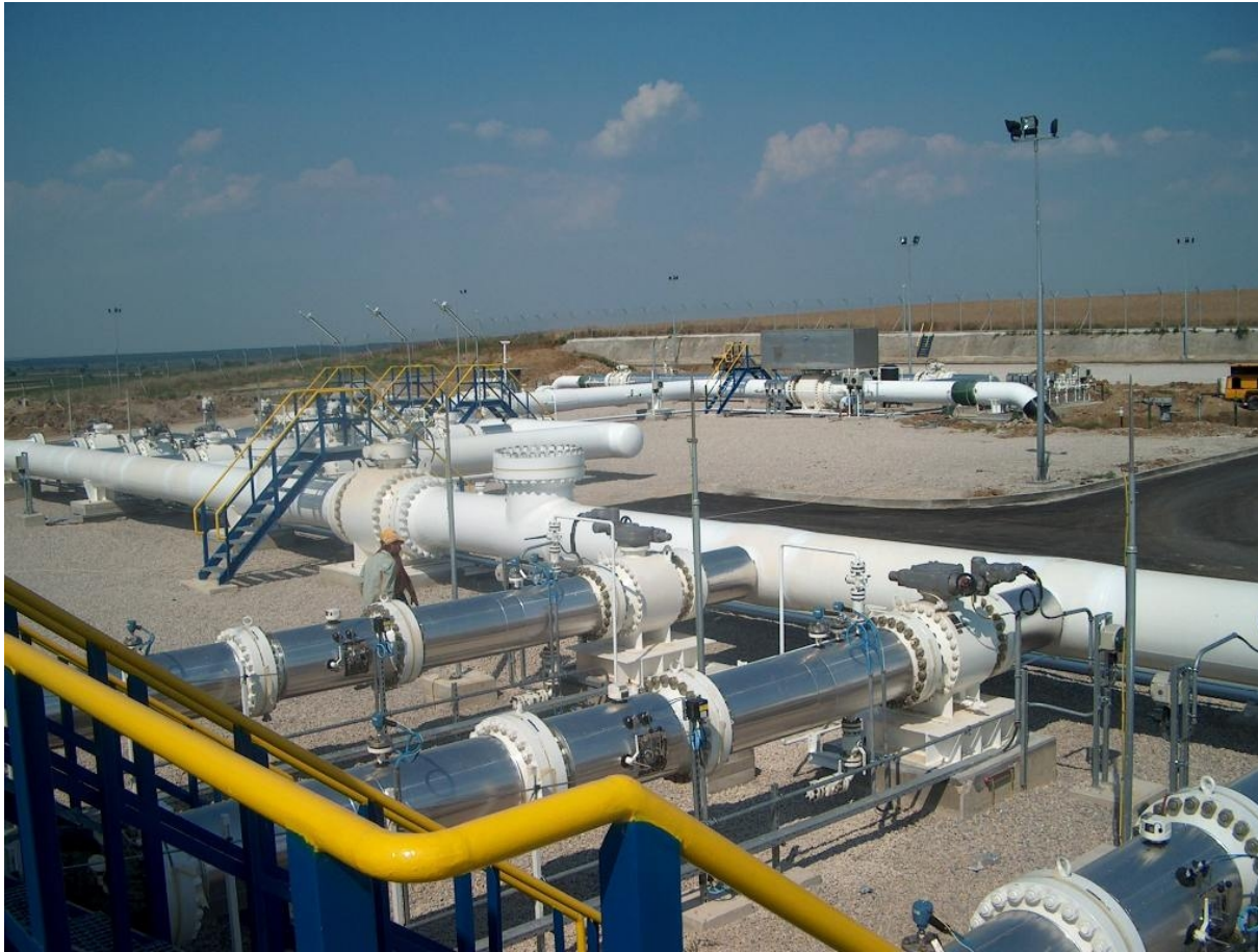
Border Station at Kipi Evros-EM installations