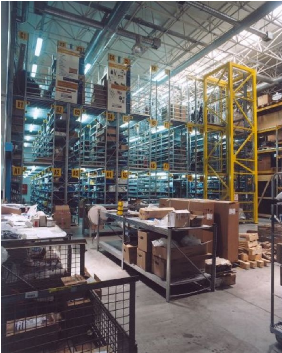
Spare parts store interior