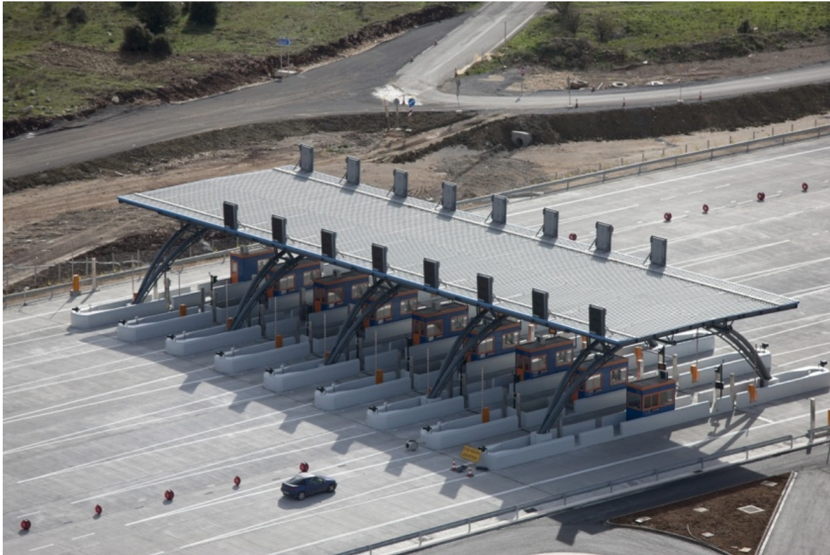
Frontal Toll Post Asea