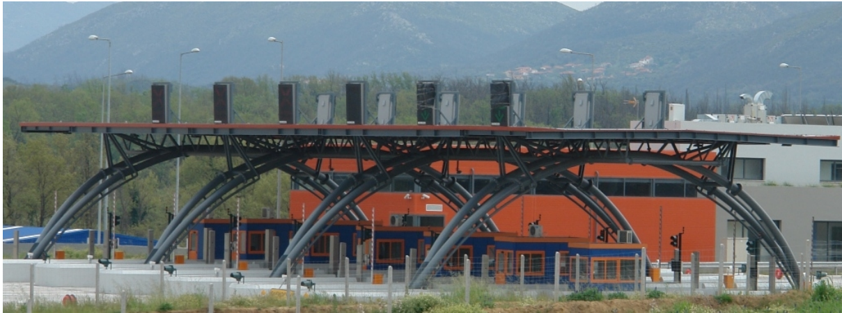
Frontal Toll Post Asea