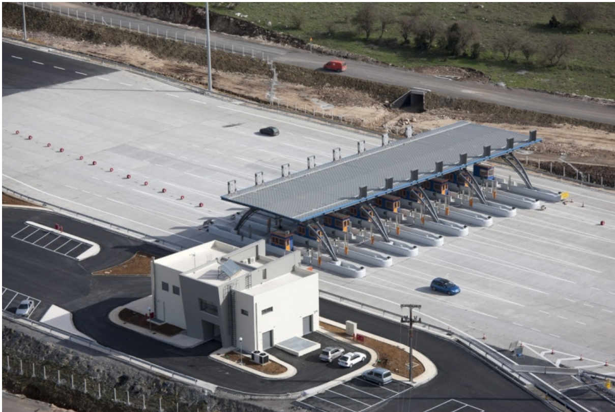
Frontal Toll Post Asea