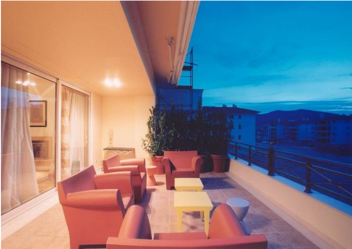
Night view from apartment balcony