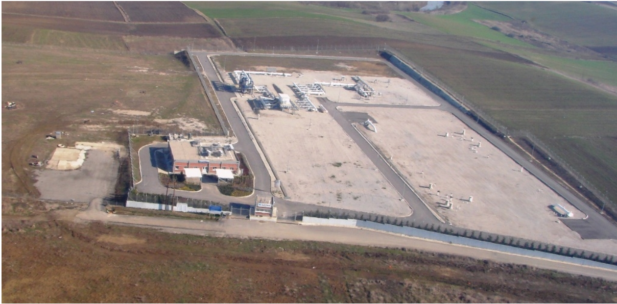
Border Station at Kipi Evros-Aerial View