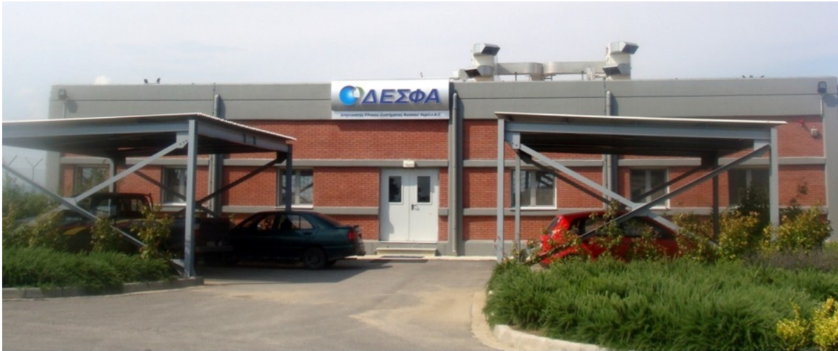
Border Station at Kipi Evros-Control Building