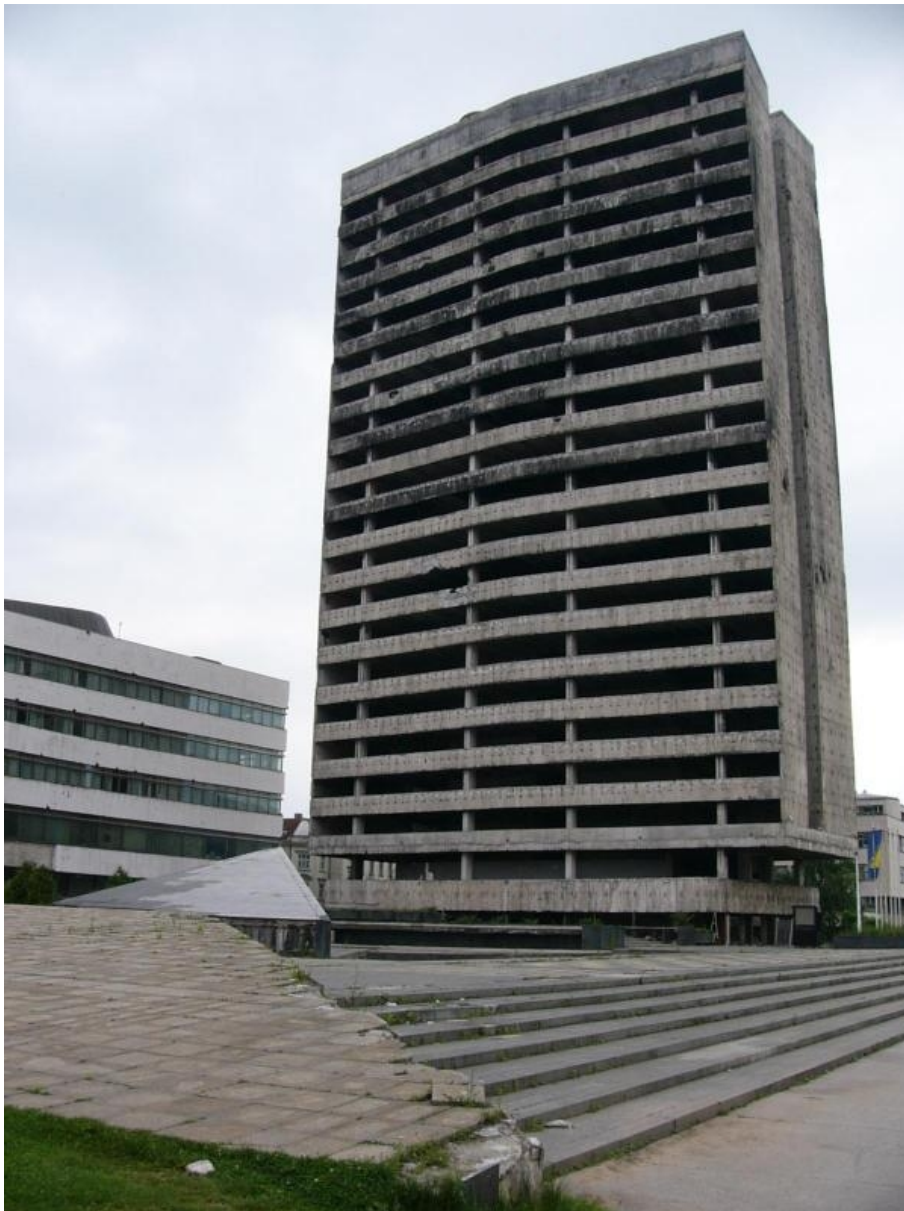
Post War Building View