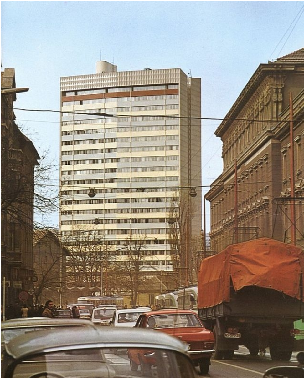
Building view before the war