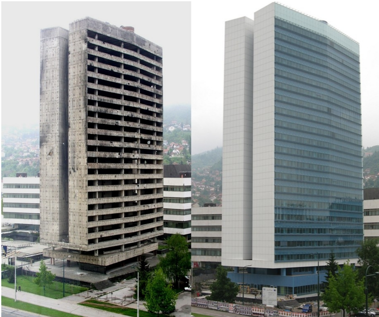
Building before and after the reconstruction