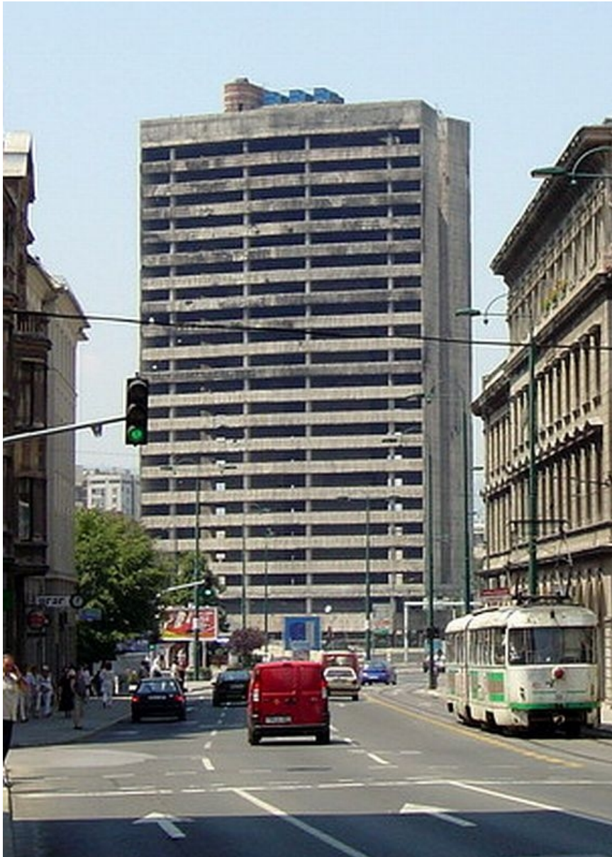
Post War Building View