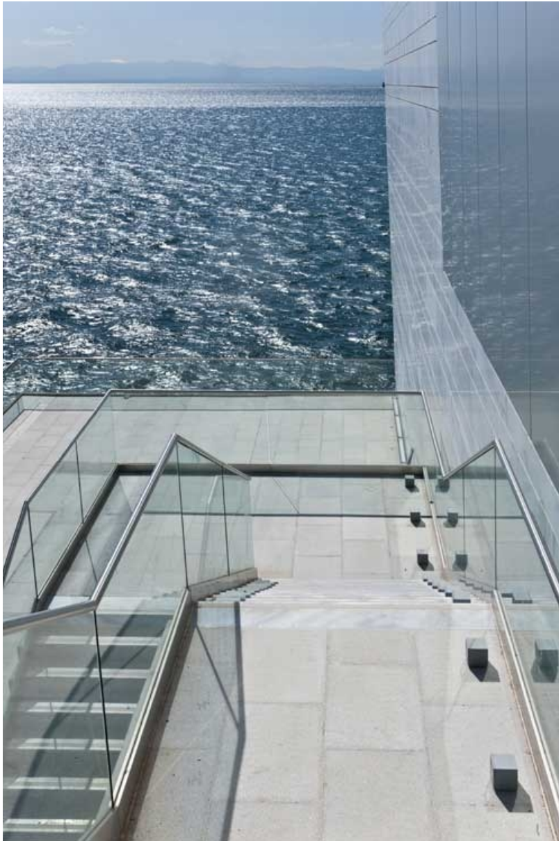
Descending the staircase