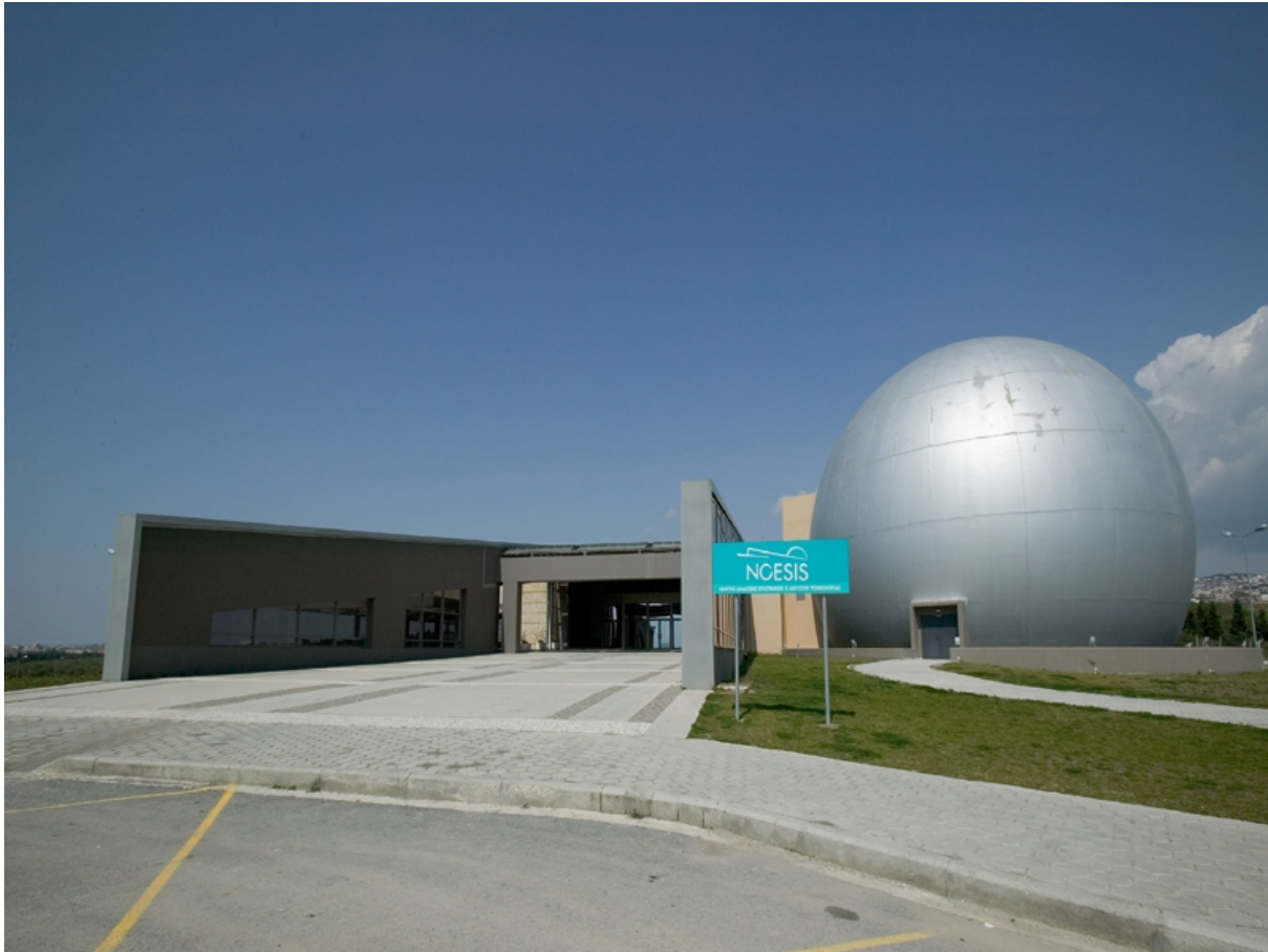
Museum South Entrance