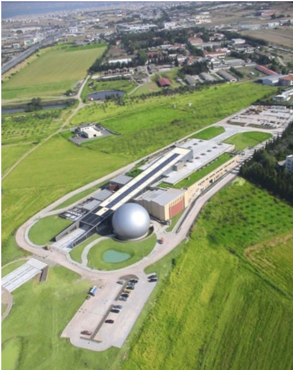
Museum Aerial View