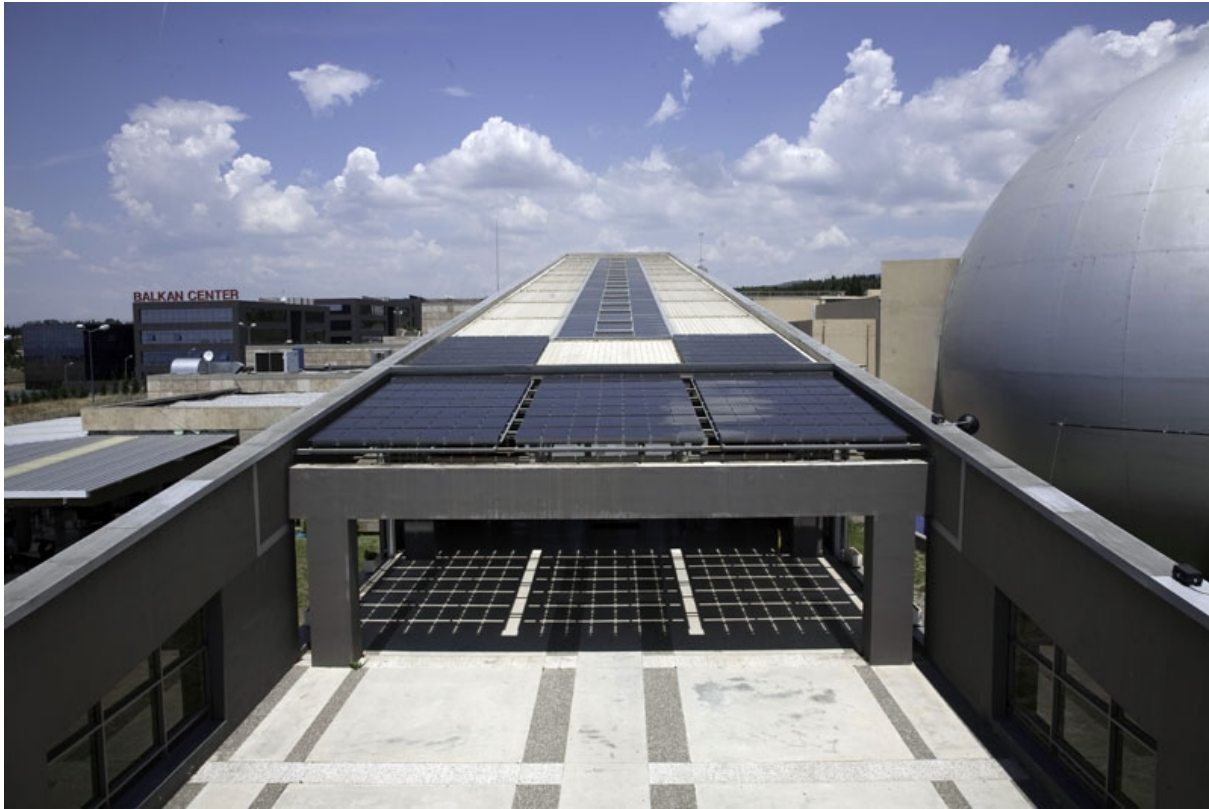
Roof top View