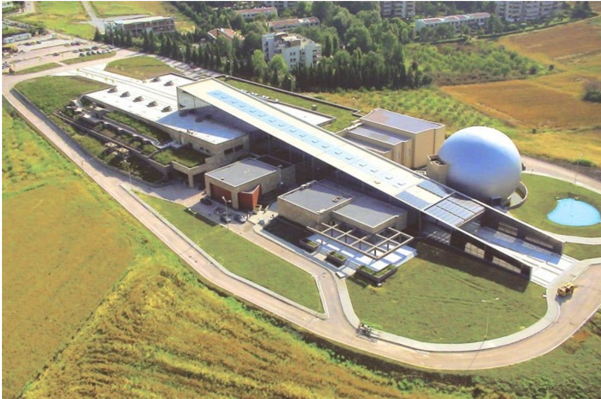
Museum Aerial View