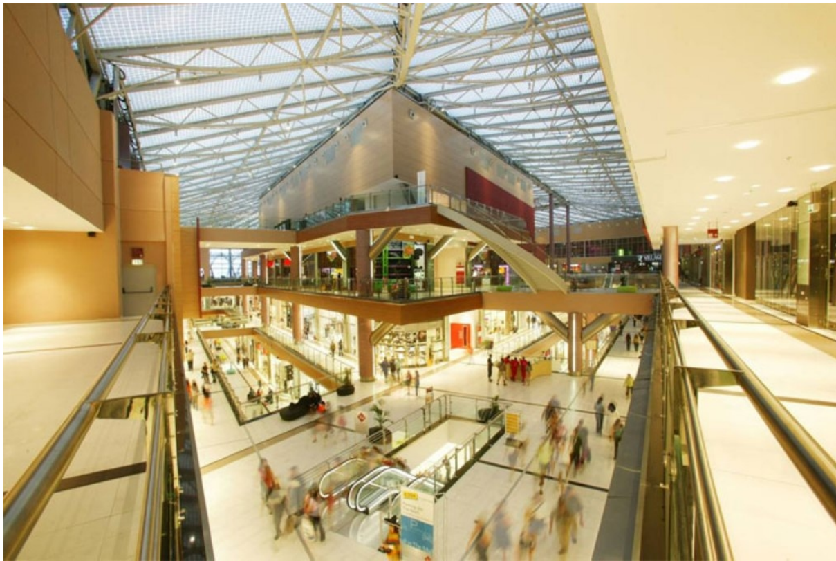
Interior view of the roof