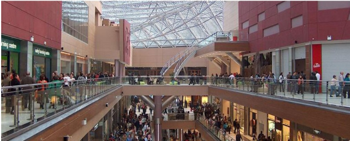
General interior view