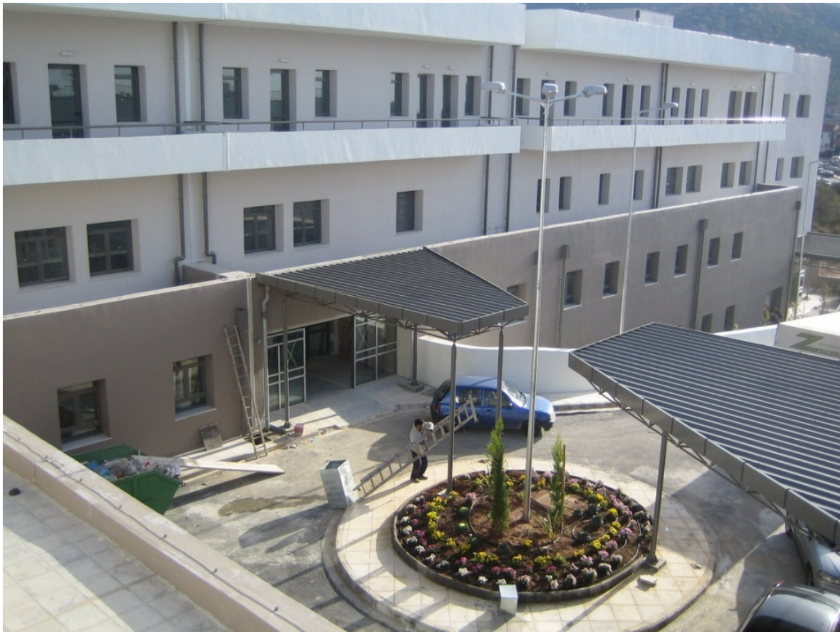
New hospital building