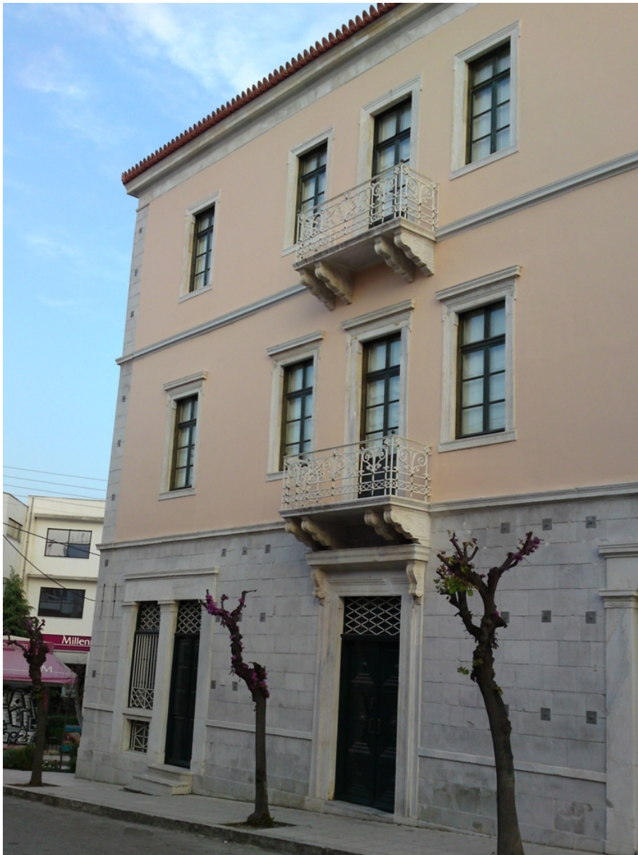
Mitropoleos Street View