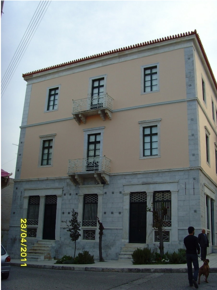
Panagiotopoulou Street View