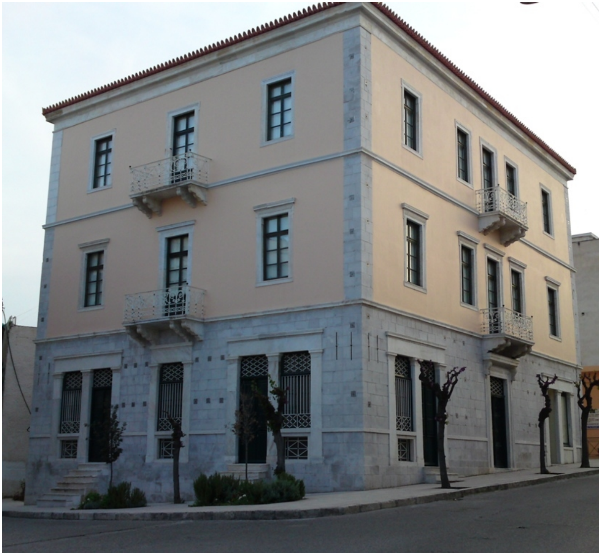
View from street corner