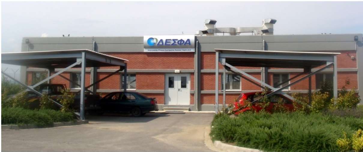
Border Station at Kipi Evros-Control Building