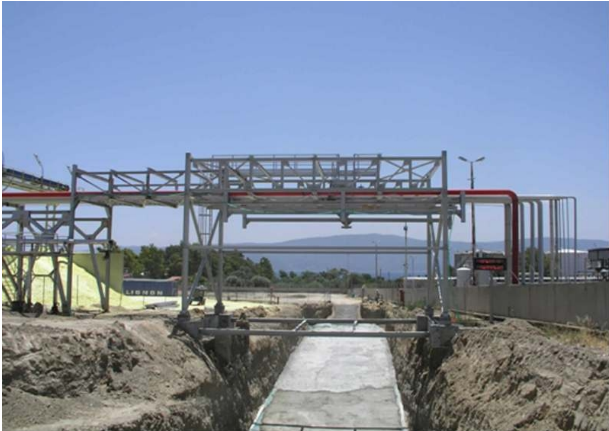
Piperack at Motoroil Hellas Refineries