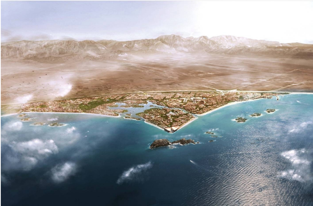
General photorealistic view