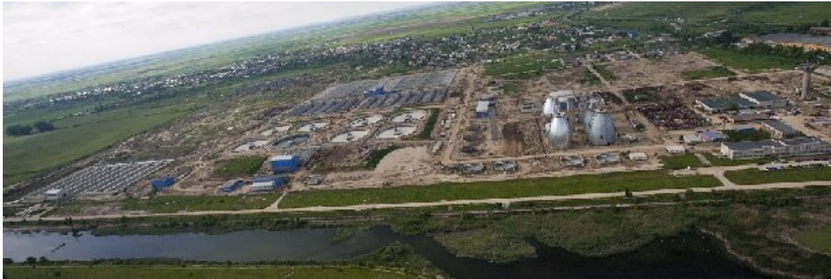
Plant Aerial View