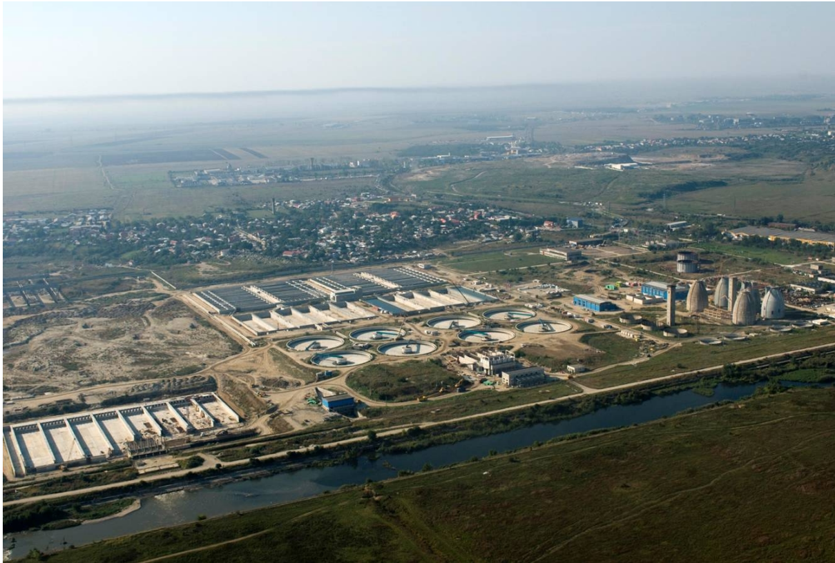
Plant Aerial View