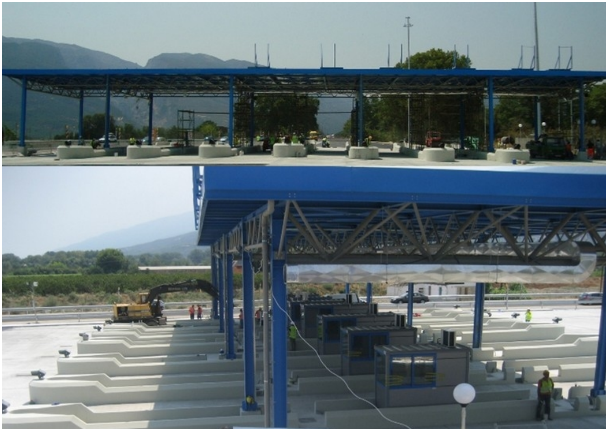
Frontal Toll Post Pirgetos - Construction phase