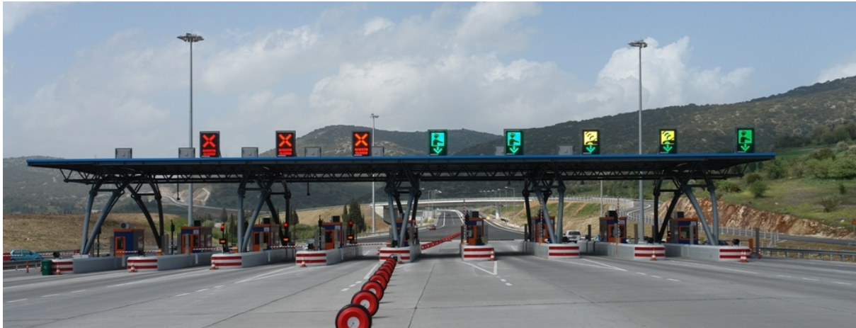
3d image of toll shed