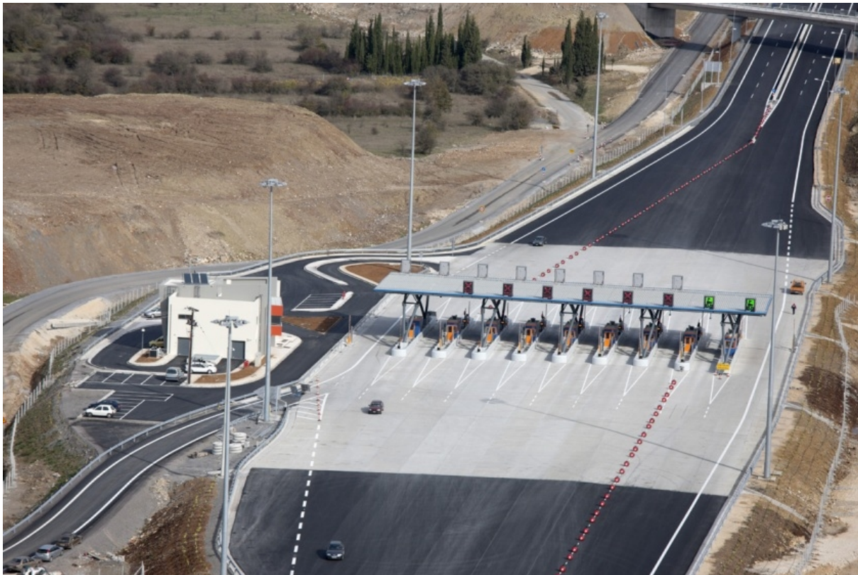
Frontal Toll Post Asea